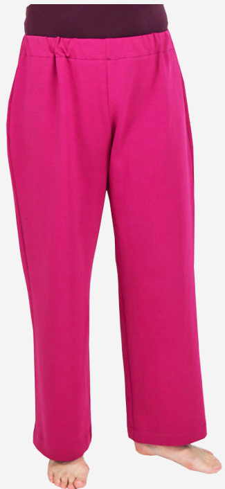
HOLLY cosy ohne Tasche